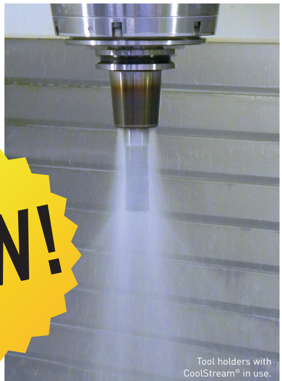
Tool holders with CoolStream® in use.