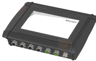
CONTROLLER EASY TOOL-ID 2.0