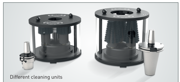
Different cleaning units