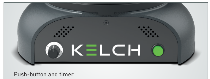
Push-button and timer